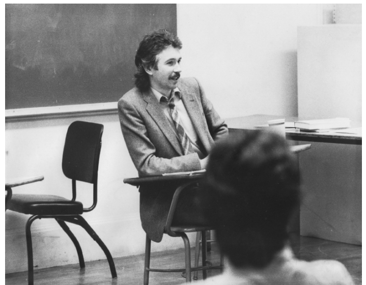
Figure 3: Photo of Stephen Brookfield teaching at Columbia University in the 1980s.

I think everything in Higher Education is commodified to some degree,